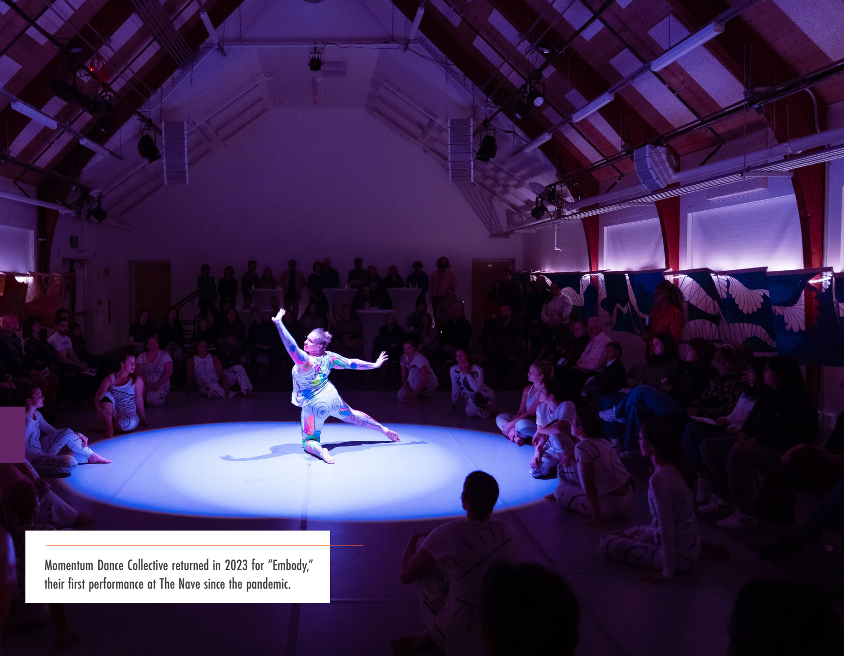
Momentum Dance Collective returned in 2023 for “Embody,” their first performance at The Nave since the pandemic.