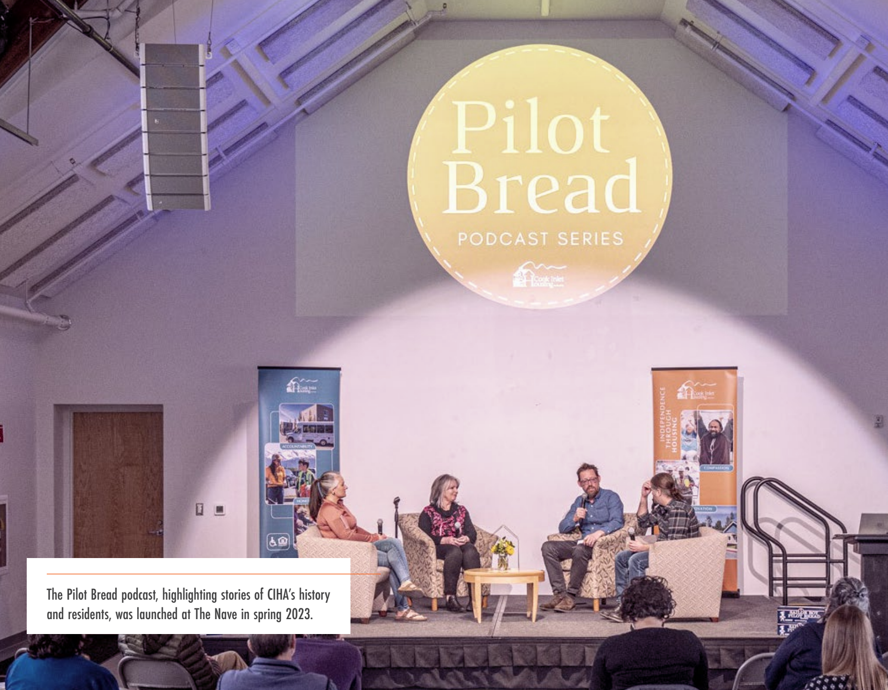
The Pilot Bread podcast, highlighting stories of CIHA's history and residents, was launched at The Nave in spring 2023.