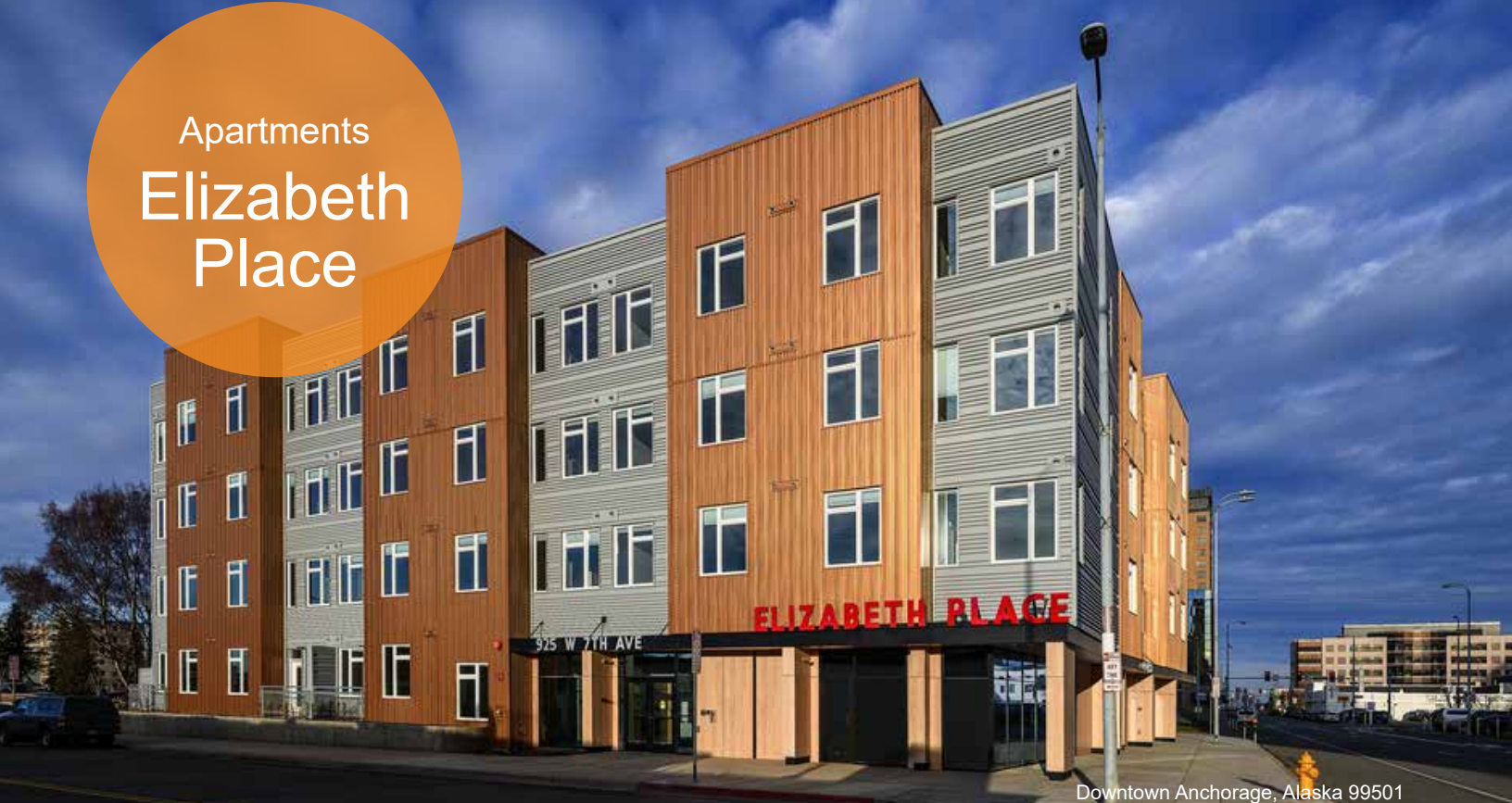
Downtown Anchorage, Alaska 99501