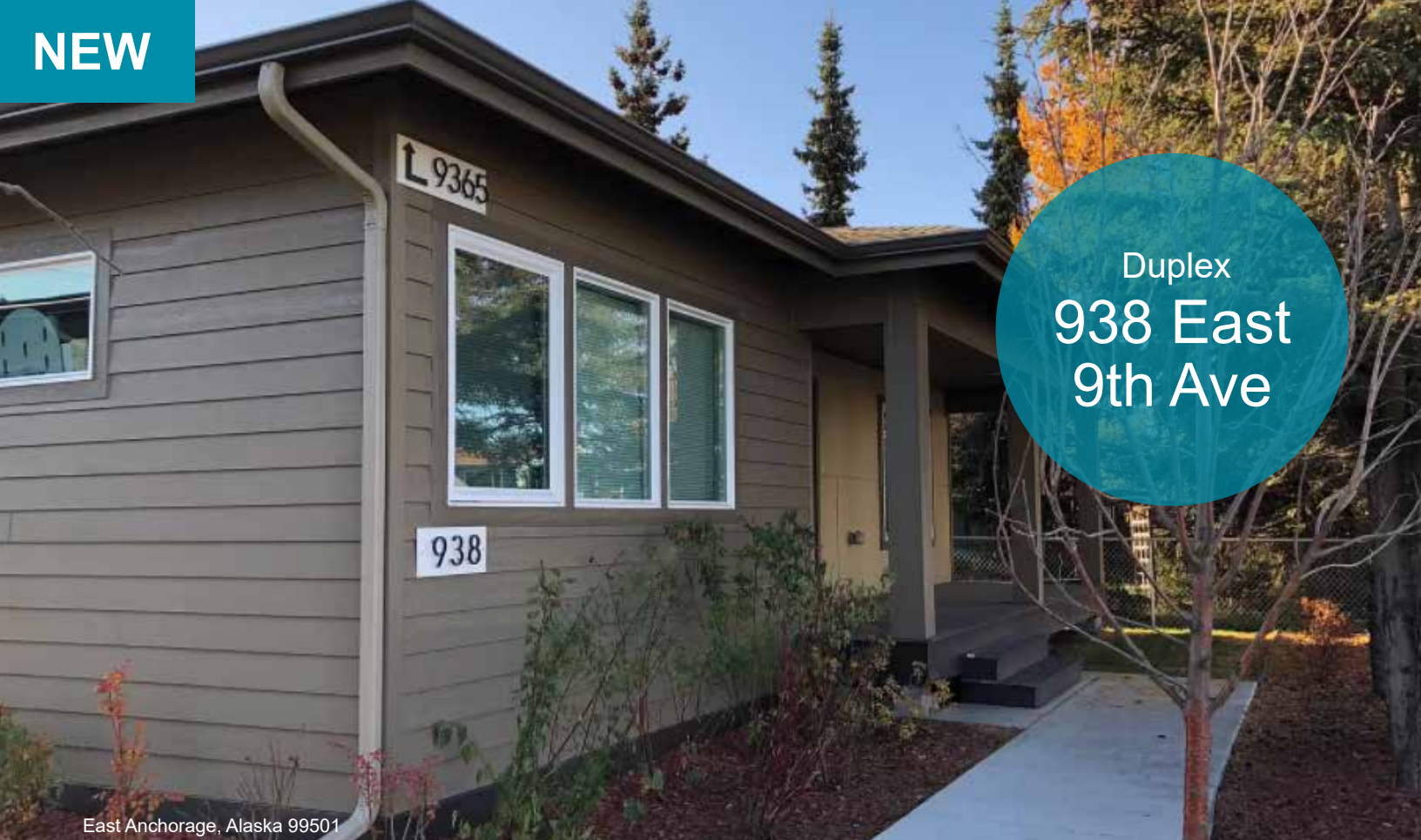
East Anchorage, Alaska 99501