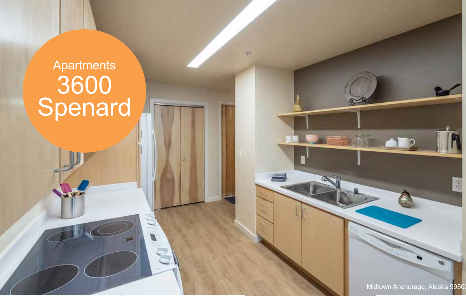
Midtown Anchorage, Alaska 99503