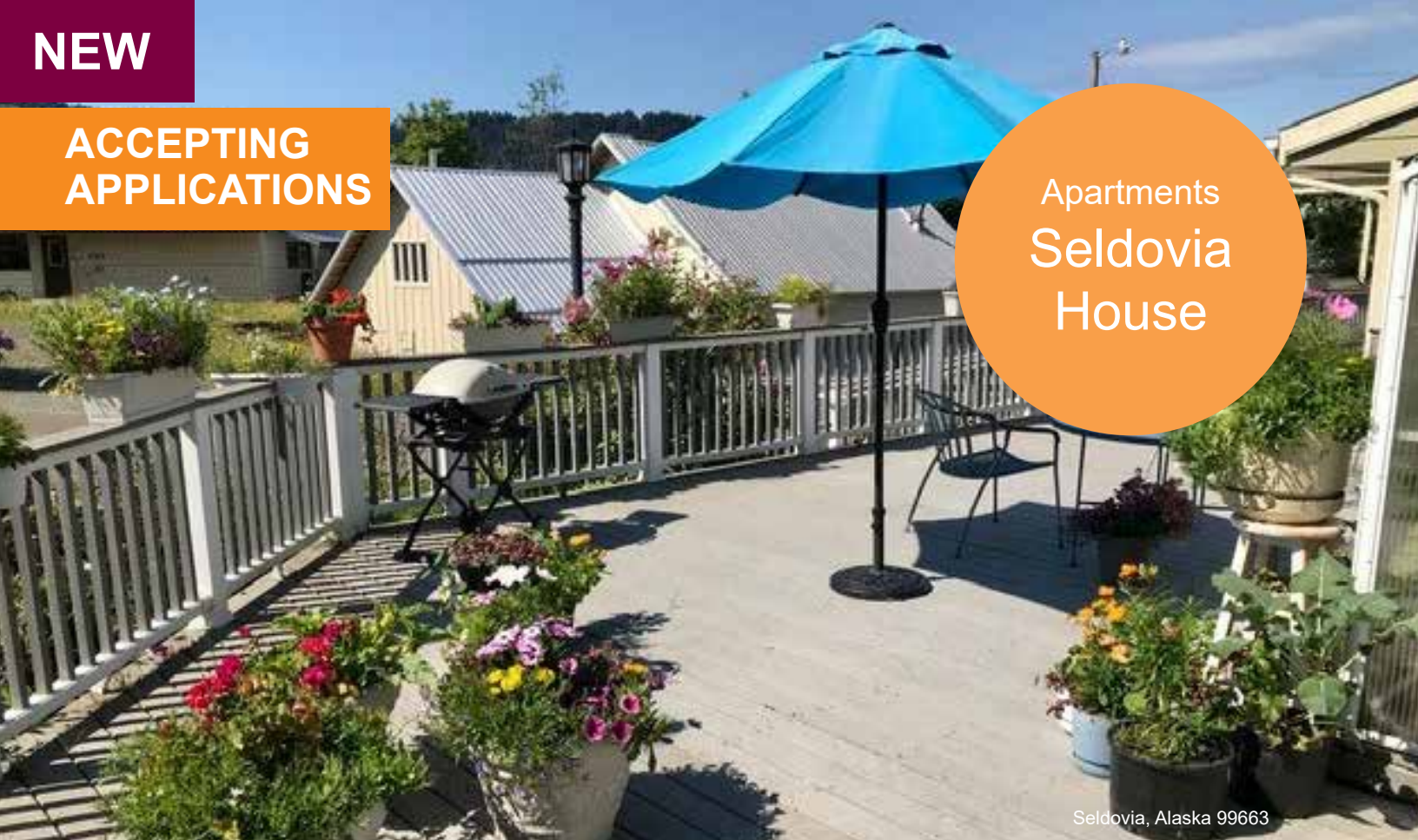
Seldovia, Alaska 99663