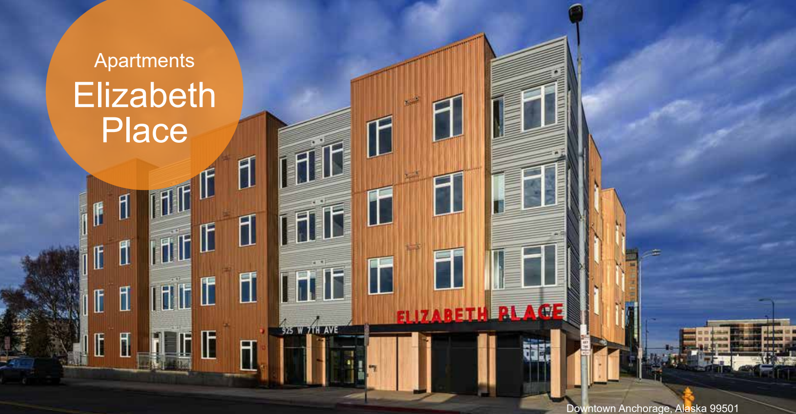
Downtown Anchorage, Alaska 99501