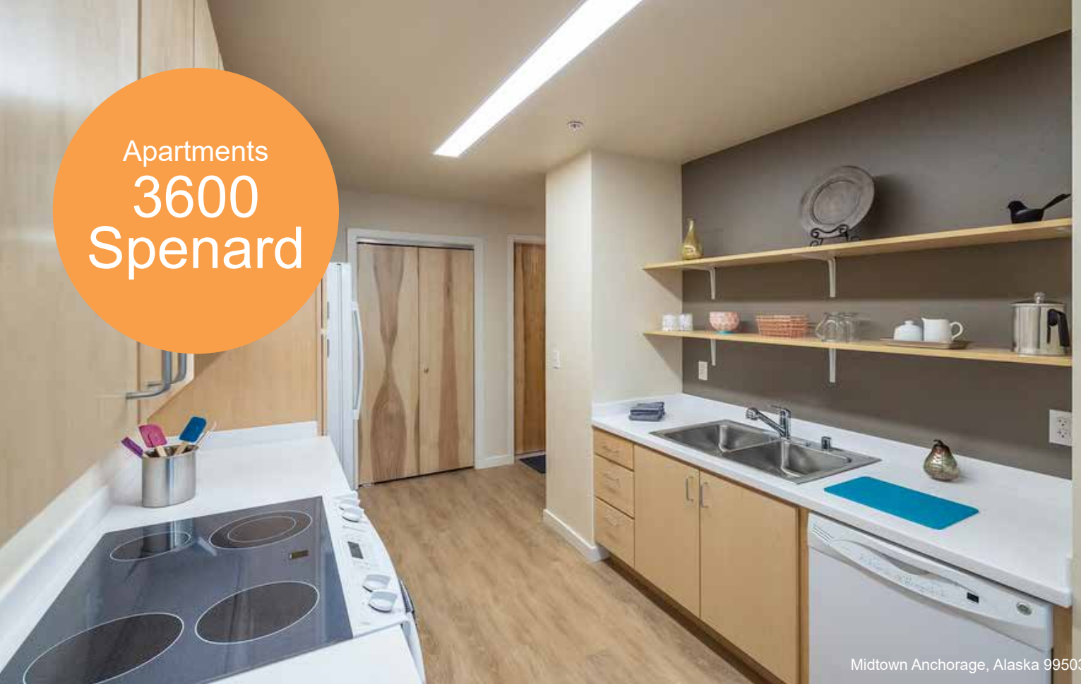
Midtown Anchorage, Alaska 99503