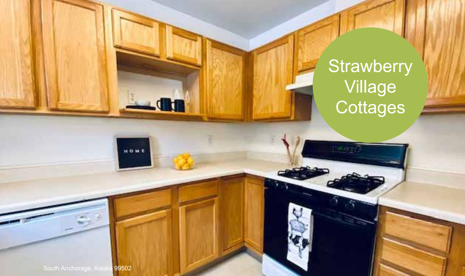
South Anchorage, Alaska 99502