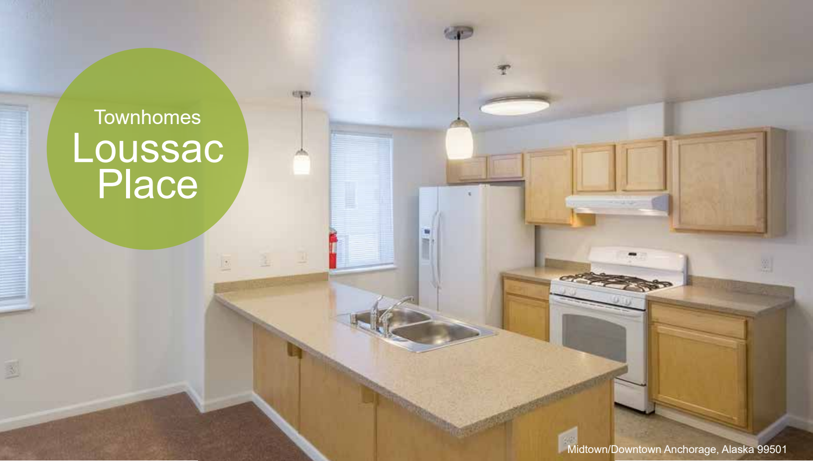
Midtown/Downtown Anchorage, Alaska 99501